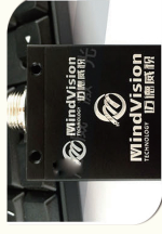
金屬氧化物標刻 Metal oxide marking