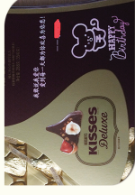
印刷製品打標 Printing paper product marking