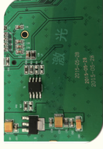
電機晶片打標 Micro chip marking