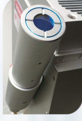
國際技術雷射器 Laser technology