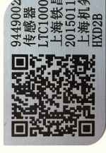
不銹鋼二維碼打標 Stainless steel two-dimensional code