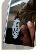
不銹鋼打白 Stainless steel offset