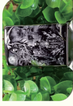
ziprom打光機個性打標 Ziprom lighter personality marking