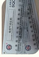
普通金屬標刻 Ordinary metal marking